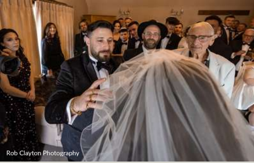
Rob Clayton Photography