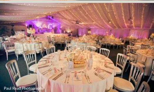
Paul Read Photography