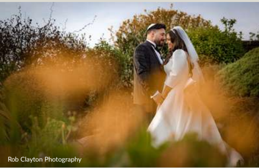
Rob Clayton Photography