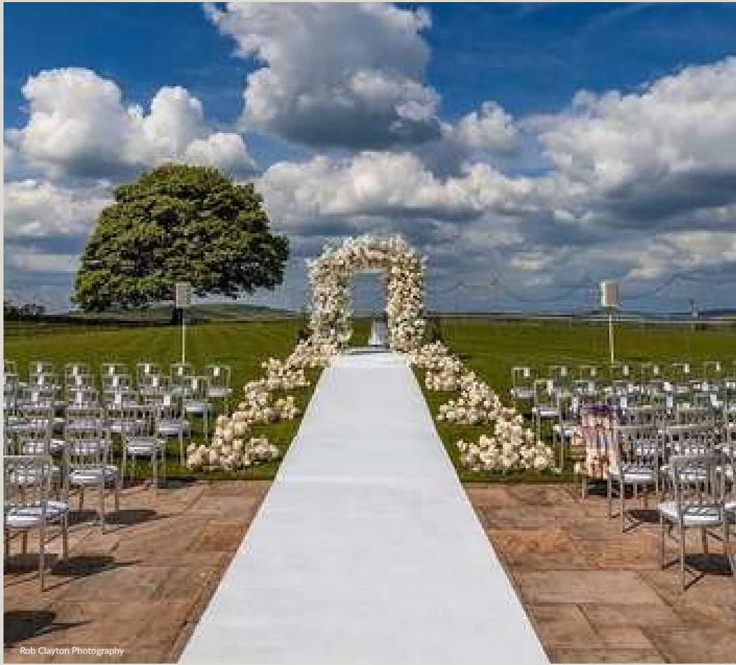
Rob Clayton Photography