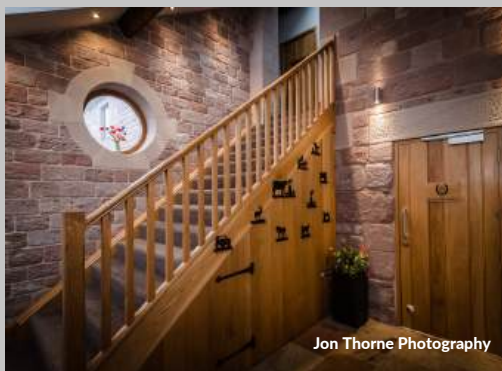
Jon Thorne Photography